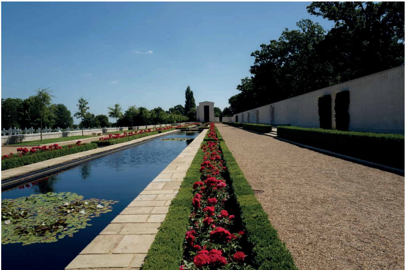
The American Cemetery, where Veterans' Day falls on 12th November (see page 5)