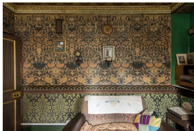
Elaborate wall decoration in the David Parr House

restored and opened up to the public so that many more can enjoy its unique atmosphere.