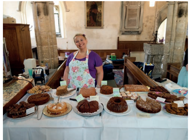
A fine choice of cakes was on offer

of the afternoon it was agreed that it had all been worth it, given that our West End Development Fund benefitted from an additional £1,000 when all contributions were taken into account.