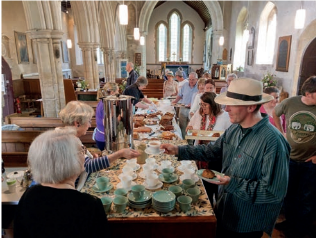
Open Gardens event, 10th June 2018

The temperature had not reached its highest point when we participated in Madingley Hall's Open Gardens event one Sunday afternoon in June, by providing teas, and selling plants and home-made produce, as well as some wonderful hand-stitched cushions.